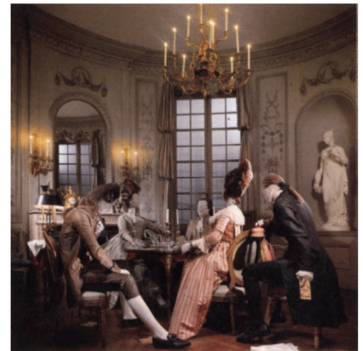
THE CARD GAME: CHEATING AT CAVAGNOLE