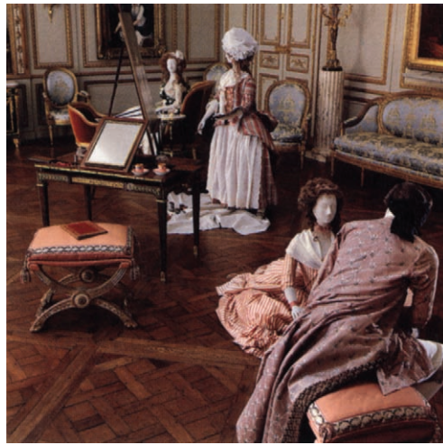
THE PORTRAIT: AN UNEXPECTED ENTANGLEMENT

Suit ( Habit à la française ). French, 1780–89. Black silk pile voided velvet with dark red faille ground and multicolored floral silk embroidery, ivory silk satin with multicolored floral silk embroidery. Rogers Fund, 1932 (32.40a–c)