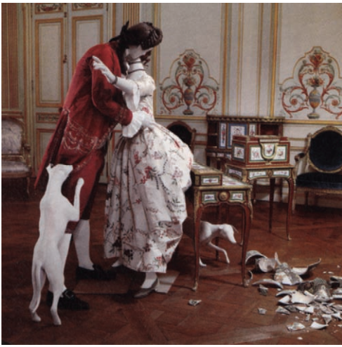
THE BROKEN VASE: A CONSOLING MERCHANT