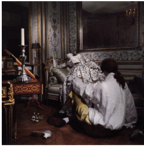
THE LATE SUPPER: THE MEMENTO