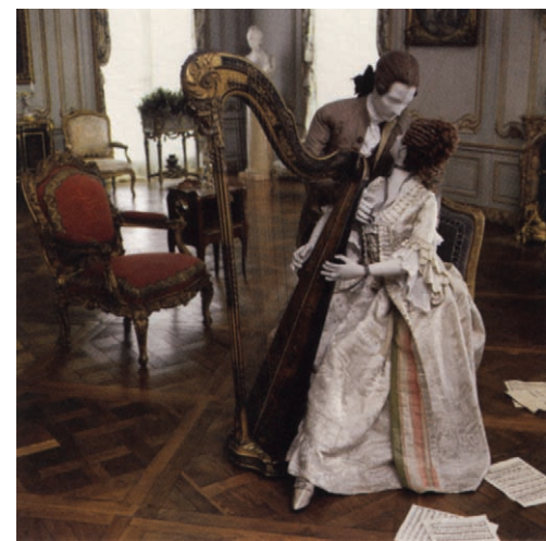
THE MUSIC LESSON: A WINDOW OF OPPORTUNITY

Paneling ( Boiserie ). French, 1775–78, with later additions. Carved, painted, and gilded oak. Purchase, Mr. and Mrs. Charles Wrightsman Gift, 1972 (1972.276.1, 2)