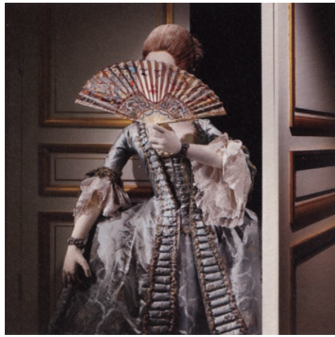
THE MASKED BEAUTY