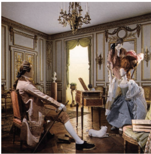
THE LEVÉE: THE ASSIDUOUS ADMIRER