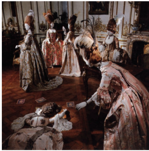
THE WITHDRAWING ROOM: A HELPFUL VALET