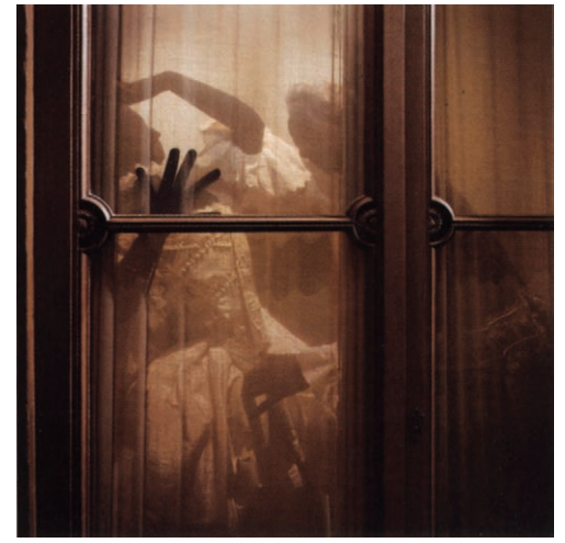
THE SHOP: THE OBSTRUCTION